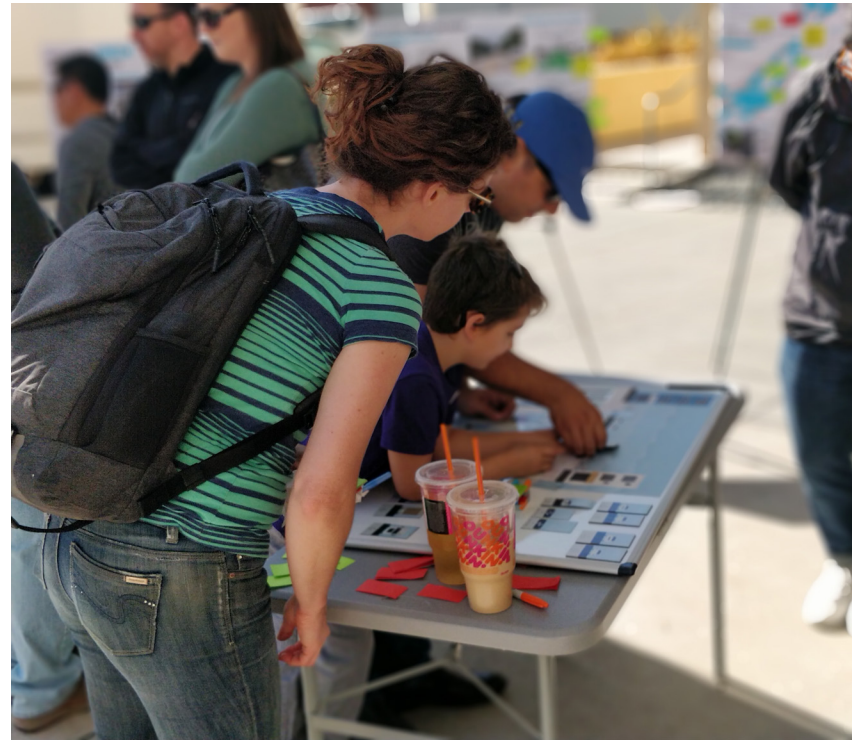
Downtown Farmers Market Pop-Up Event.