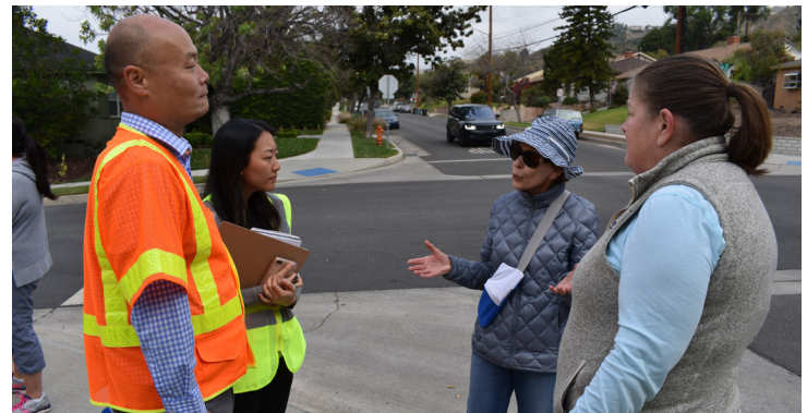
Discussing pedestrian issues on the walk with parents