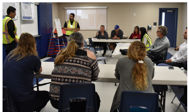
Debrief session with parents after the walk