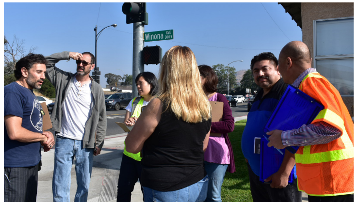
Walking through the neighborhood with parents