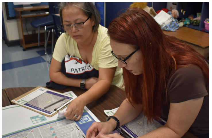
Parents identify problem areas during the debrief